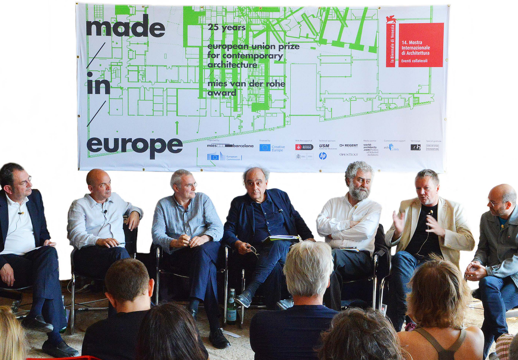
EU Award for Architecture; Symposium by the MvdR Foundation at the ECC.

If you are interested in one of our symposiums, or in case you would like to organise a symposium or workshop, please speak with us, we are sure that we are interested and can discuss all options with you.